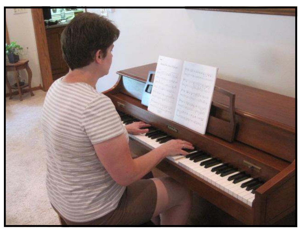
Sitting down to play on a freshly tuned spinet can be a pleasant experience for beginners and more advanced planists alike!

<u>As the owner of a spinet piano you have the advantage of playing on an</u> <u>authentic acoustic piano which is conveniently sized–approximately the same</u> <u>dimensions as a digital piano</u>. A spinet is often a good option for the home owner or apartment dweller who doesn't have an abundance of space, but who wants a real piano to play. With proper maintenance, a good quality spinet piano can be a reliable instrument that provides years of musical enjoyment.