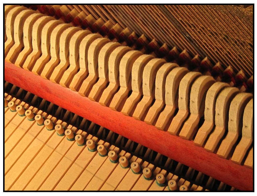
A newly regulated spinet piano action, ready to be played and enjoyed.